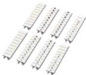
Zack marker strip, 10-section, vertically labeled with the consecutive numbers: 11 ... 20, white, width: 5 mm

Please be informed that the data shown in this PDF Document is generated from our Online Catalog. Please find the complete data in the user's documentation. Our General Terms of Use for Downloads are valid ( http://phoenixcontact.com/download )